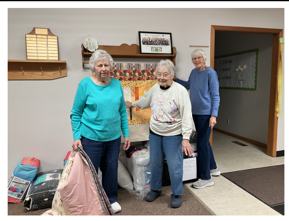
Some of the H.O.P.E. ladies displaying their quilts. They change the quilt in the hall almost weekly. Check them out!!